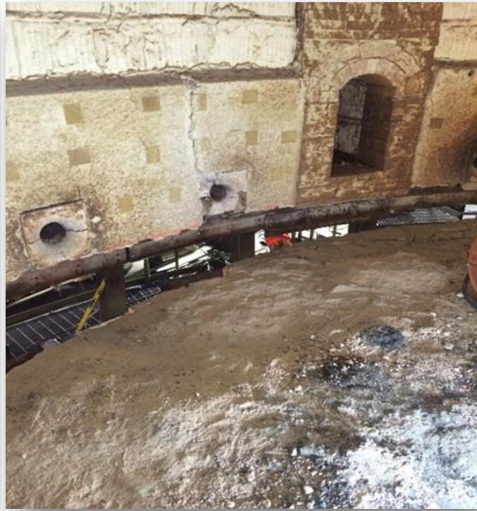
Left: Inside furnace highlighting damages to hearth floor, flues, sidewalls and roof.