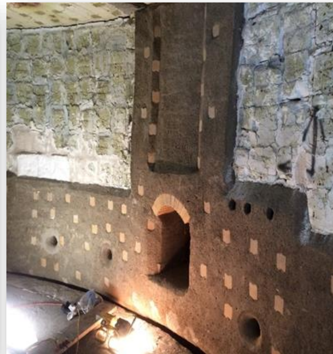
Left: Repairs to hearth and lower wall after installation of new wall castings and water troughs.