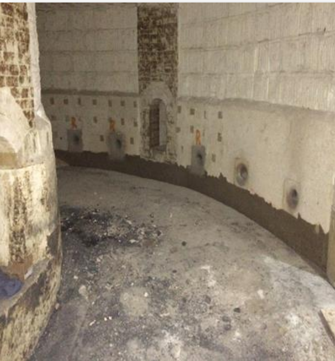
Right: Shown with wall castings, water troughs, retaining ring and water seal blades removed.